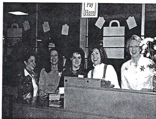
League Members At Silent Auction